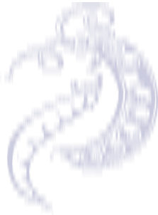
Promoting Overall Health in Our Communities

Presented by the National Alliance for Hispanic Health and the Healthy Americas Foundation , ¡Vive tu vida! – Get Up! Get Moving!® is the premier national and local celebration of Hispanic